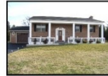
101 Cardinal Glen Cir Sterling $420,000