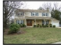
8621 Ordinary Way Annandale $674,900