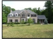
9871 Oxcrest Dr Fairfax Station $1,549,900