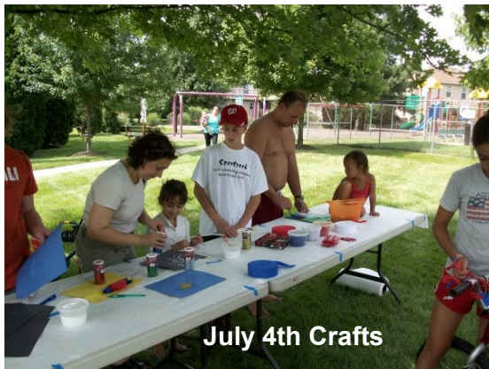
July 4th Crafts

Next year, we plan to post the dates at the pool as soon as it opens. This way, anyone who wants to attend can plan trips around the date. We are hoping to get some new volunteers to lead the main effort for the party for next year. It is mostly coordination of all the various moving parts -- the moon bounces, the DJ, the coins, the emcee, and the signs. We have a good team already and are always looking for more helpers to join us. Contact us at social@armfieldfarm.org if you are even a tiny bit interested.