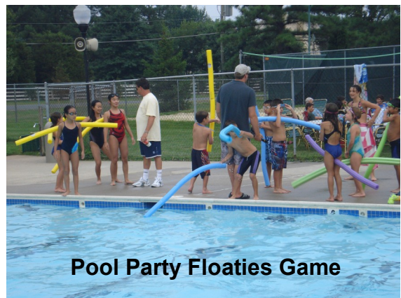
Pool Party Floaties Game