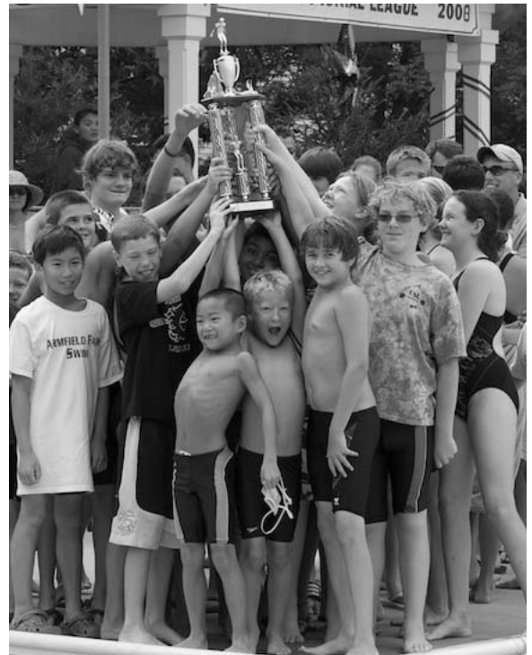
Victory for the swim team!

Your trash can should NOT be visible from the street on non-pickup days