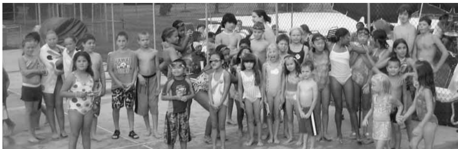
Kids had tons of fun at the Annual Pool Party