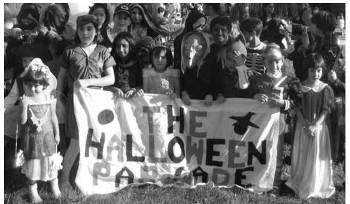
Kids get ready for the Halloween Parade

Please DO NOT park your commercial trucks, vans, and trailers in our neighborhood