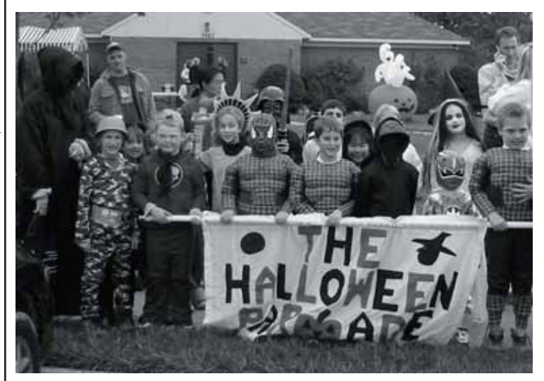
Kids get ready for the Halloween Parade

CHECK OUT OUR NEW WEBSITE www.armfieldfarm.org