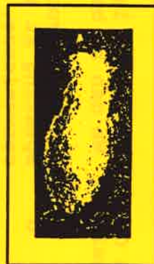
Gypsy Moth Egg Mass (actual size)