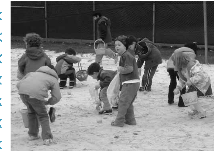
Kids pick up egss at the Spring Fling

Your trash can should NOT be visible from the street on non-pickup days